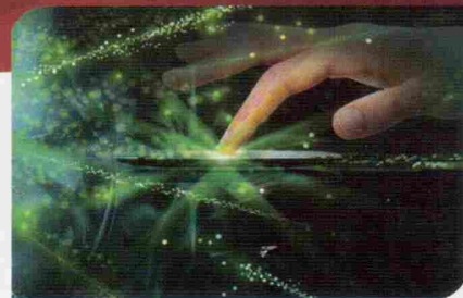
Office Automation Equipments